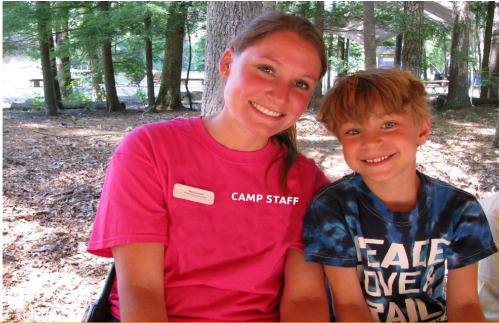
CONNECTICUT CAMPS – LEADERS IN CHILD DEVELOPMENT